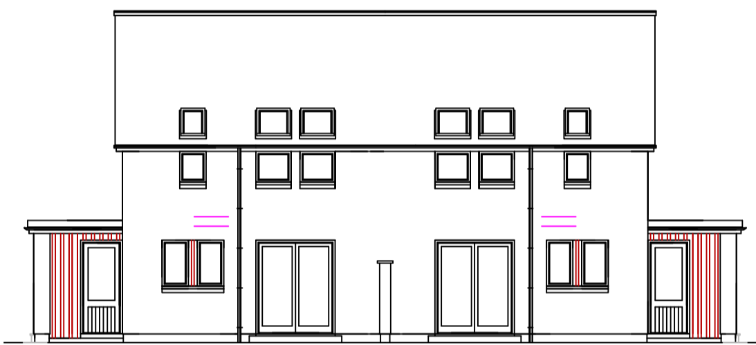
REAR ELEVATION (north west)