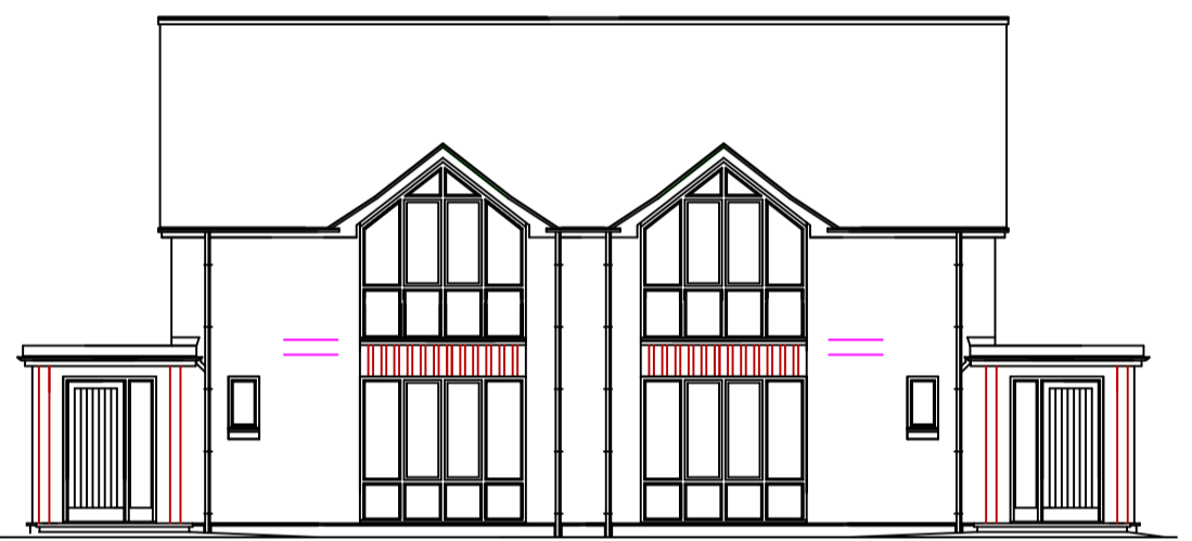
FRONT ELEVATION (south east)